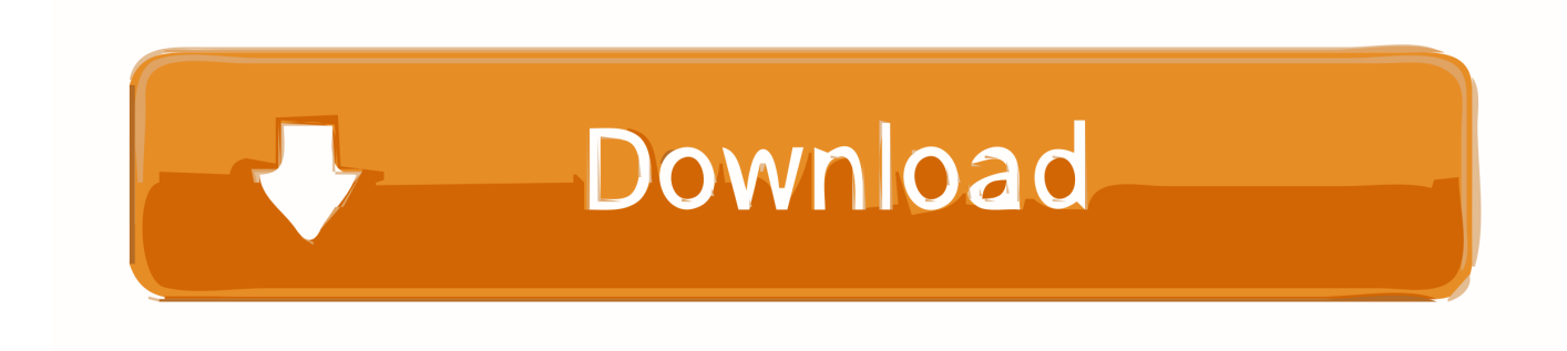
Torchlight 2 Necromancer Summoner Build